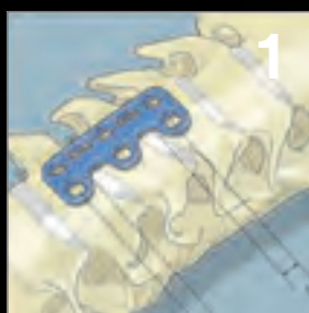
Determine Plate Size