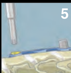
Inserting Initial Screw