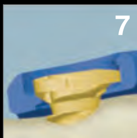
Seating the Screws