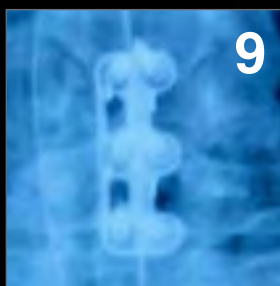
Final AP Position