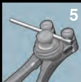
Rod Template & Bending