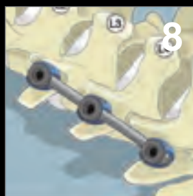
Set Screw Placement